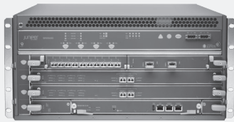
SRX5400 Services Gateway

Junos Space Security Director runs on the Junos Space Network Management Platform for highly extensible, network-wide management functionality, including ongoing access to Juniper and third-party Junos Space ecosystem innovations.