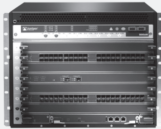
SRX5600 Services Gateway